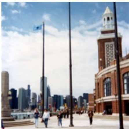
Navy Pier. Chicago May 13, 1997